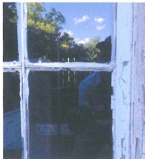
This photo shows the deterioration of the windows sashes and the loss of glazing needed to hold the panes in place.