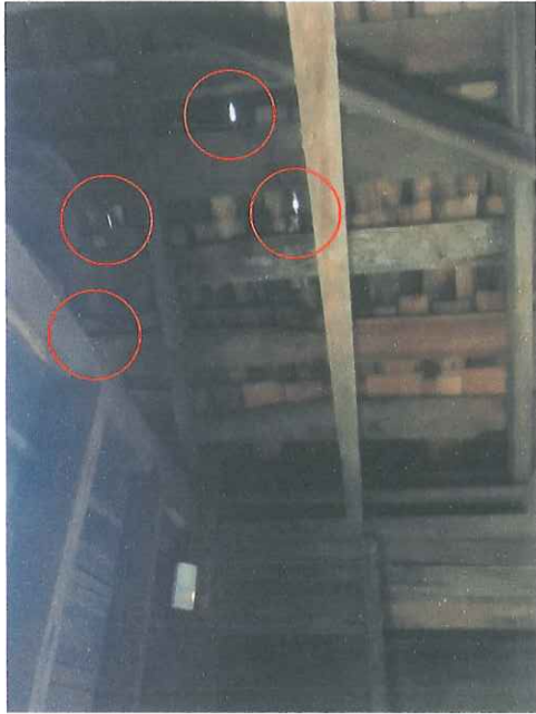
View of the Cook House roof from inside. Front, left side along the wall, notice three holes.