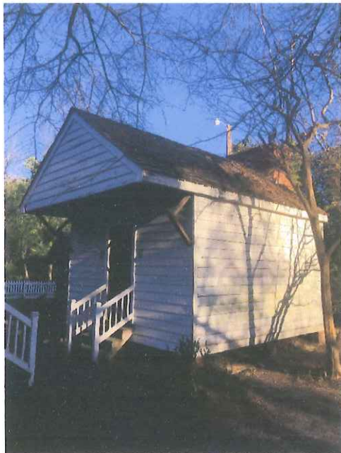
View of the Cook House, we are working with a tree removal company to trim back the limbs over the top of the Cook House.