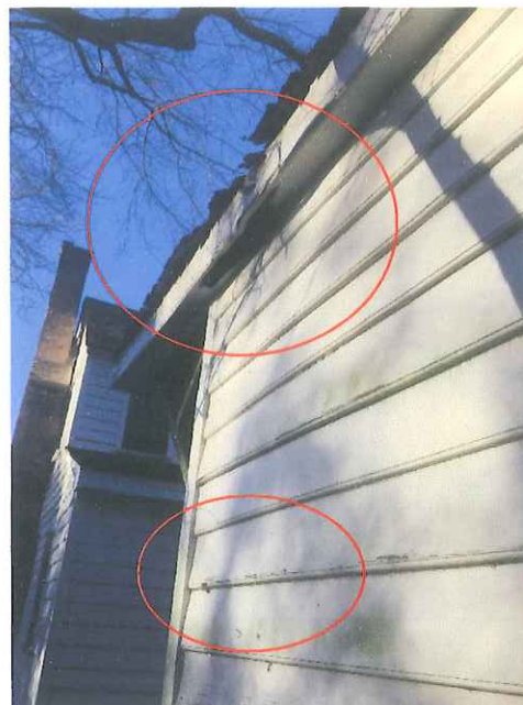
Notice the deterioration of the fascia and soffit, evidence of water running down the rafter, pooling in the soffit.