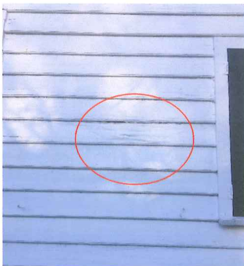
View of the wall between the kitchen & dining room windows, just above the ac unit, showing signs of wood deterioration.