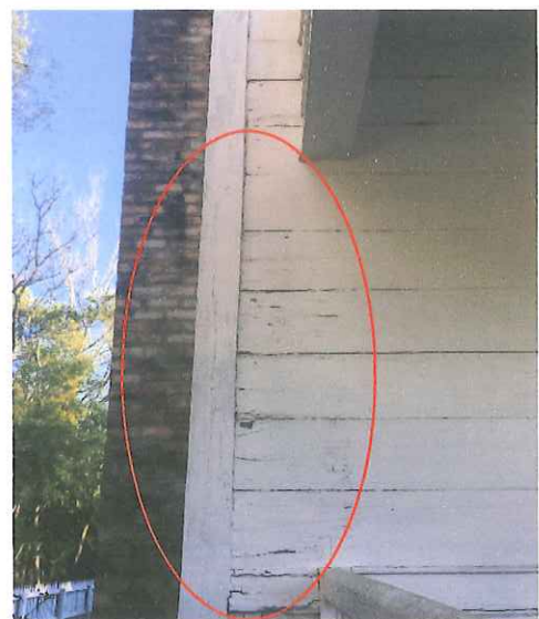
Left side of porch, showing signs of wood deterioration.