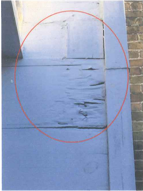
Right side of porch, showing signs of wood deterioration.