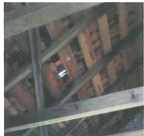
View of the Cook House roof from inside. Middle left side, notice the large hole hidden by a rafter in the previous photo.