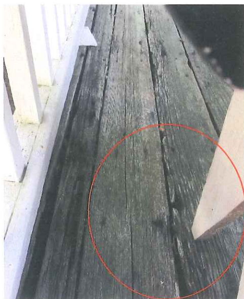
Porch deck boards showing wear.