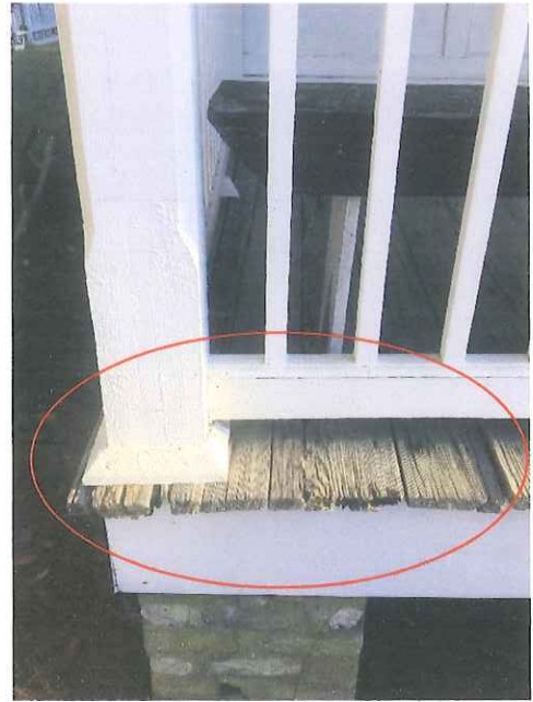
Porch deck boards showing wear.