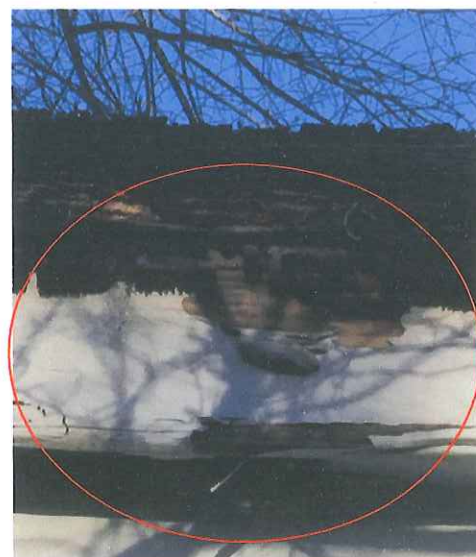
Advanced deterioration of the fascia and soffit (close-up).