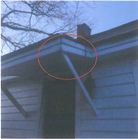
Back stoop, notice the corner showing signs of wood deterioration.