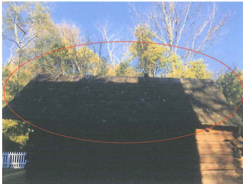
Side view of the Corn Crib roof, notice the deterioration of the shake shingles.