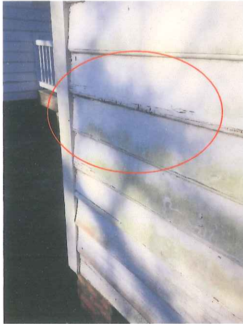
Notice the deterioration of the siding along the bead edge.