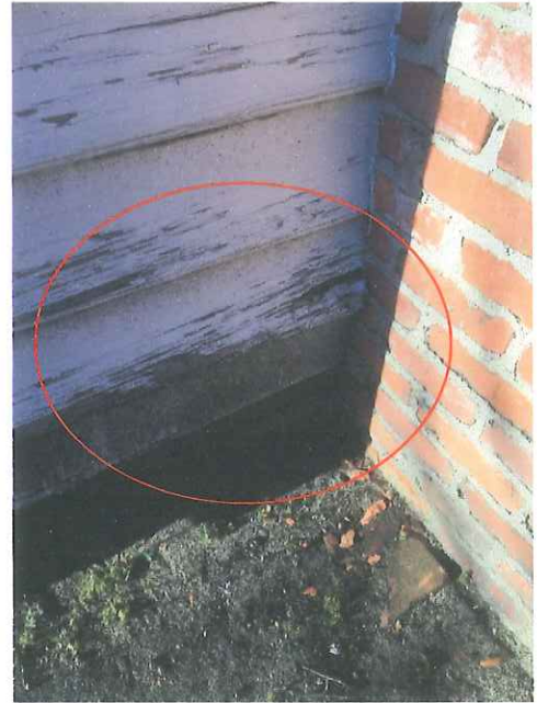
Cook house wall/chimney - showing signs of deterioration and needing paint.