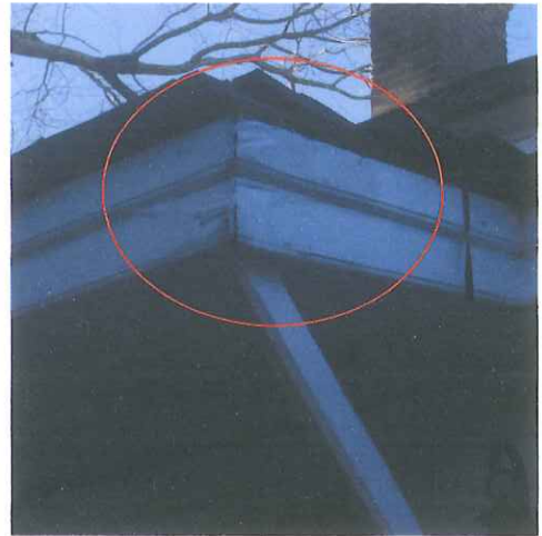
Back stoop, notice the corner showing signs of wood deterioration (close-up).