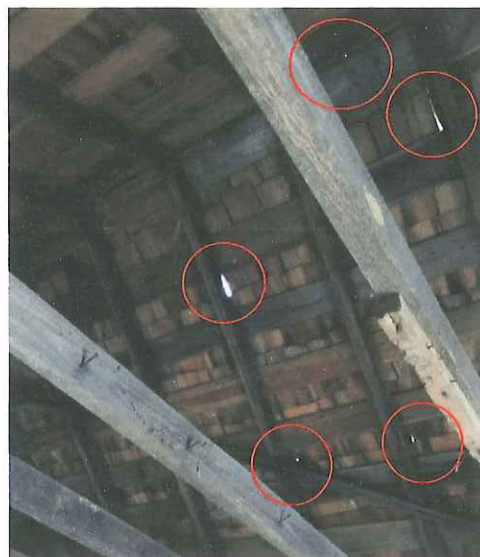
View of the Cook House roof from inside. Middle left side, notice the 5 holes.