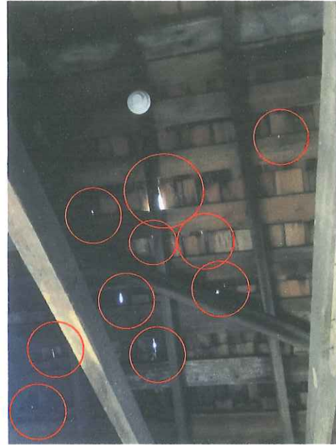
View of the Cook House roof from inside. Front, left side from gable down, notice 10 holes in the roof.