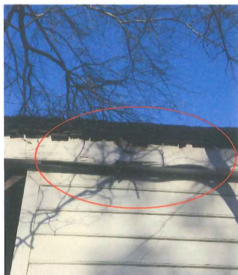
Advanced deterioration of the fascia and soffit.