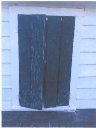
The shutters are the primary defense for each of the windows in the JKH. As you can see they take a real beating from the elements. The wood simply dries out and hardware fails leaving them flopping in the wind. This causes damage to the windows.